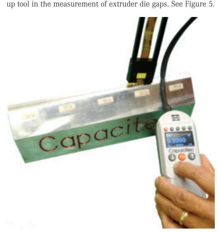
Figure 5: Fully portable Gapman® Gen3

NEW GAPMAN® GEN3 FOR PRODUCTION SET UP APPLICATIONS. For users that would like the option of a simpler set up tool in production, a legacy Gapmaster3 semi portable shop floor system has been replaced with a fully portable Gapman®<sub>Gen3</sub>. The main design enhancements of the Gapman® Gen3 are accuracy of 0.5 µm and resolution of 0.1 µm for a 250 µm full-scale gap range. It offers 10,000 data point logging and storage capabilities, 22-hour life, and a simple PC user interface. It is lightweight (400 grams), fully portable using 3 AA batteries and has a rugged enclosure and built in meter. The Gapman<sup>®</sup><sub>Gen3</sub> records and stores data points for easy transfer to SPC, in support of Six Sigma and other quality systems. An industry standard USB Type A port combines data output and external power. The data files are a .CSV file structure for simple import into Microsoft Excel®. The portable Gapman®<sub>Gen3</sub> non-contact gap measurement system can also replace feeler gauges as a set