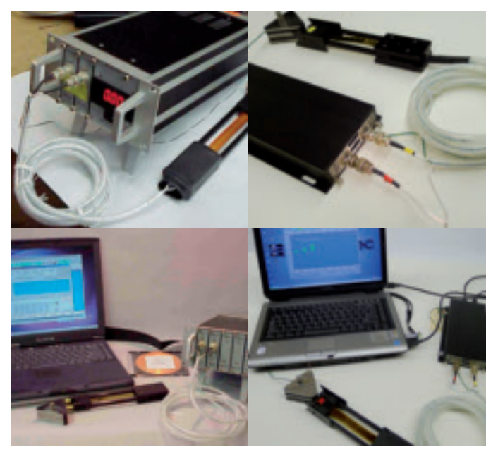
Fig. 2 A: Previous Generation 4100 Fig. 2 B: New Generation 200 Series Fig. 2 C: Before: 4 channel rack with AC power and custom analogue output ribbon cable

oped by Capacitec, results in the system only requiring two channels of electronics versus 12 channels to drive six different dual sensor gap measurement wands. The new compact package does not, however, support the switching style electronic cards for the GPD-2 150 micron dual switching symmetric sensor wand option.