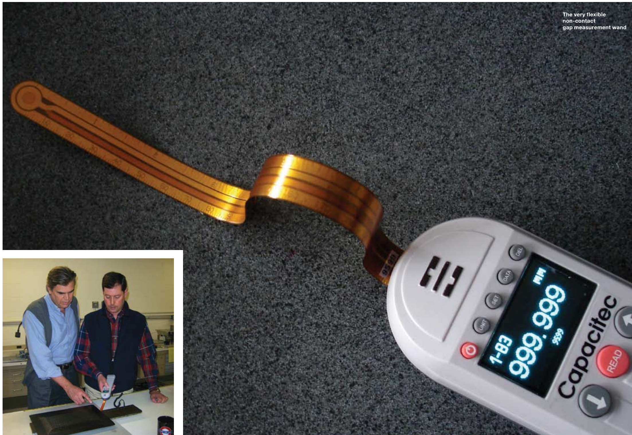
The very flexible non-contact gap measurement wand

The most critical application where repeatable gap measurements are required in aircraft assembly is during the packer and shim selection process. Liquid and solid shimming is necessary during the fabrication of aircraft components such as the wing and fuselage