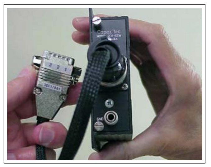
3 sensor input view with TRW/Souriau connectors