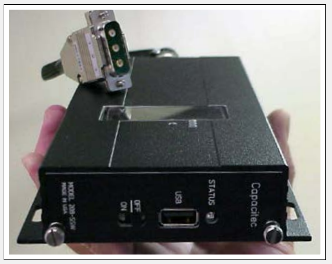
Output view of 3 channel system