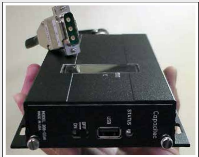
Output view of 3 channel system