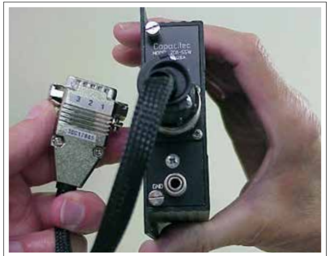
3 sensor input view with TRW/Souriau connectors