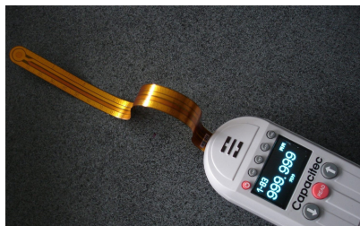
Gapman Gen3 with flexible wand and dual capacitive non-contact sensors

The sensors are connected to the Gapman Gen3 electronics and use a separate conductive ground lead being attached to the target surfaces. The sensor pair acts as one plate of a capacitor. The grounded targets act as the other plate of the capacitive return. The gap between each sensor face to the grounded target is linearly calibrated to digital engineering units. The results can be recorded into internal Gapman Gen3 memory or sent by USB or Bluetooth to a laptop computer.